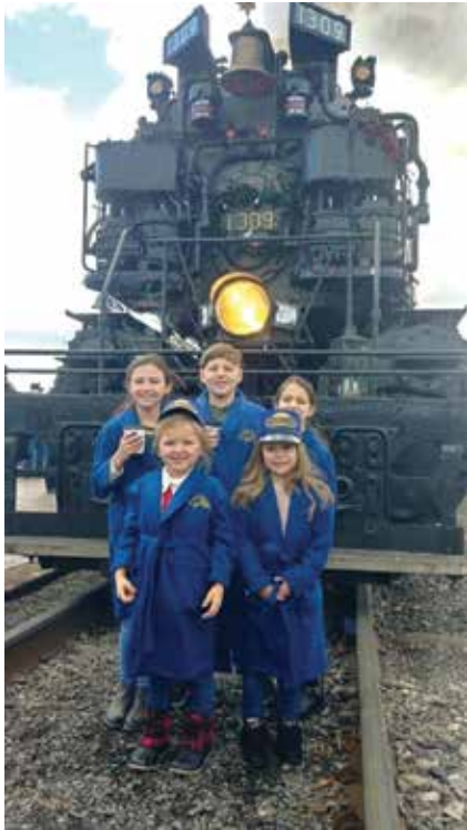
Above: Children enjoy a photo op with #1309.